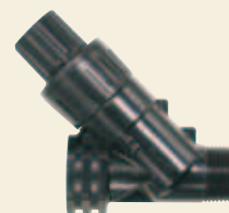
3/4" High Flow